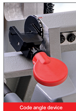
Code angle device