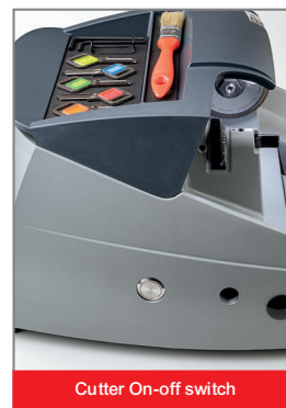
Cutter On-off switch

The on-off switch features a safety cut-out preventing the machine from starting by itself after a power interruption. Rekord Pro AY switches itself off and needs to be manually restarted to continue the cutting operation.